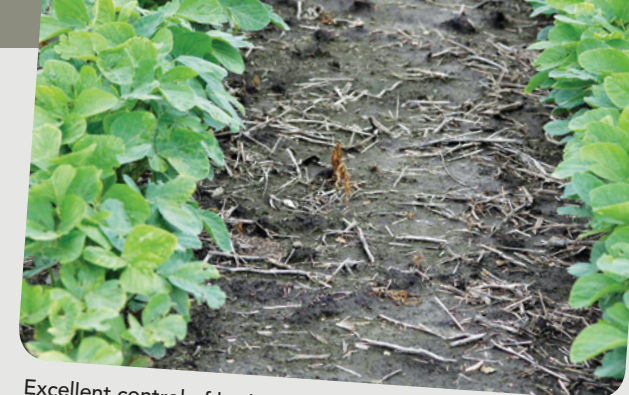
Excellent control of herbicide-resistant waterhemp can be achieved by combining a soil-residual herbicide with a properly timed postemergence herbicide.

Soil-applied herbicides require either mechanical incorporation or precipitation to move them into the soil solution where they are available for uptake. Herbicide effectiveness is reduced when a soil-applied herbicide is sprayed on a dry soil surface with no incorporation (mechanical or by precipitation) for several days following application. Surface-applied herbicides generally require 0.5 to 1.0 inch of precipitation within 7 to 10 days after application for optimal incorporation. Soil condition, soil moisture content, residue cover, and the chemical properties of the herbicide influence how much and how soon after application precipitation is needed. If no precipitation is received between application and planting, mechanical incorporation, where feasible, can still help move the herbicide into the soil solution.