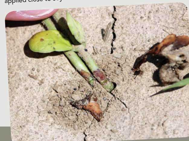
Soybean injury caused by a soil-residual herbicide applied close to soybean emergence.

Crop injury from soil-applied herbicides can be enhanced under certain conditions. The environment and herbicide application timing influence crop injury from soil-applied herbicides. Adequate soil moisture levels and low relative humidity can enhance uptake of soil-applied herbicides. Applications made immediately before or after crop planting result in a high concentration of herbicide near the emerging crop plants. Rapid herbicide absorption into the young crop plants may temporarily overwhelm the plant's ability to break down the herbicide, leading to injury symptoms.